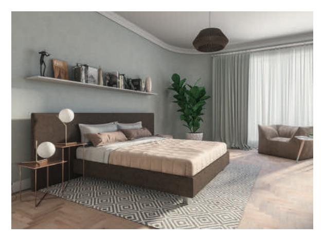
Expression bed frame