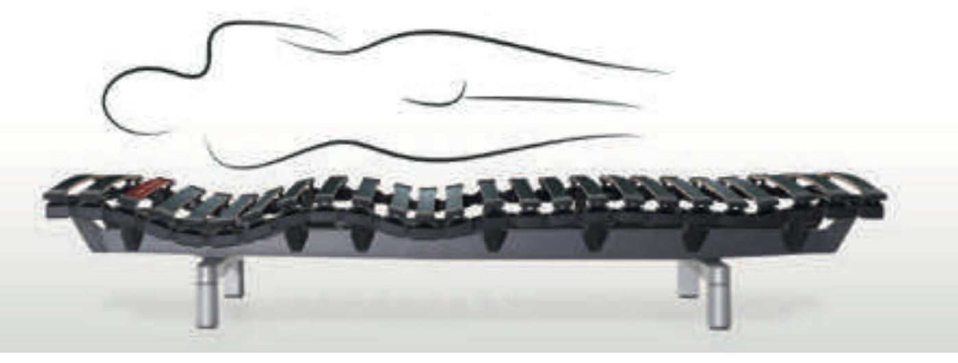
Head section Mid-shoulder section Lumbar section Middle section