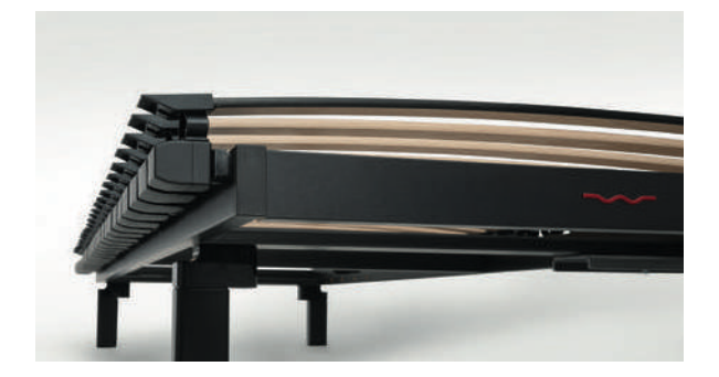
Spring action until the edge