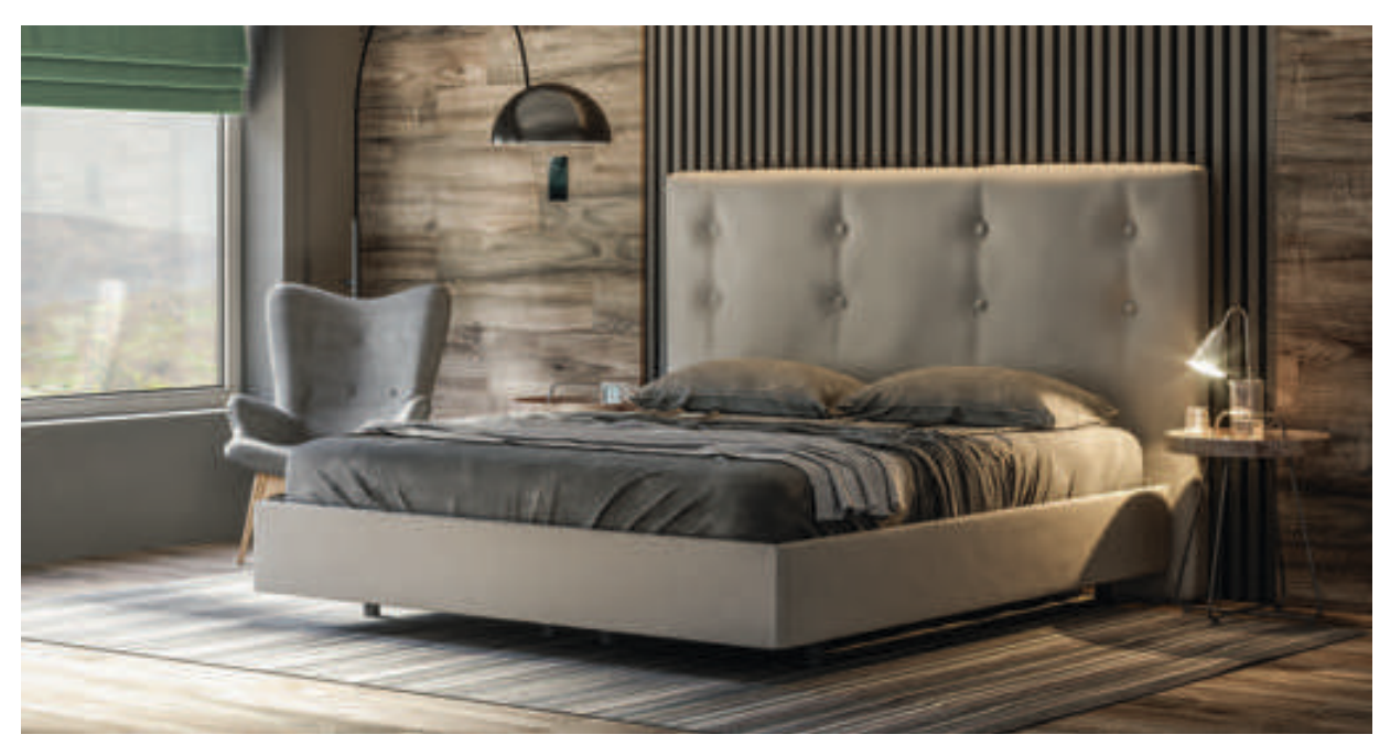
CLICK Bed Frame with Madrid headboard