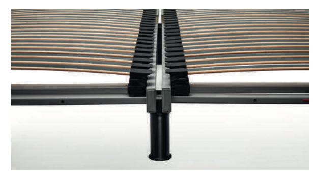
No uncomfortable centre bar