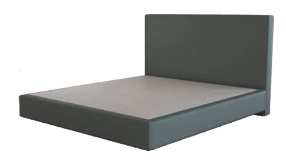
Swissflex® Box _05 bridge® with wrap-around and removable cover Can be used with Boxes Fix, 24 and 33cm height