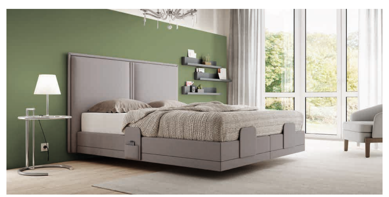
{\it Swissflex}{\it @}~{\it Box\_95RF, height~24cm, headboard~Paris~128cm, fine~fabric~upholstery~Jersey~Steel}