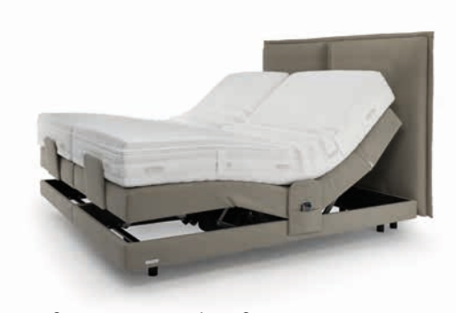
Swissflex® Box _95RF bridge® 4 motors, radio control (head, back, upper and lower leg sections individually adjustable) height 24cm: lower Box 8cm / upper Box 16cm 2-part slat base incl. synchronous cable