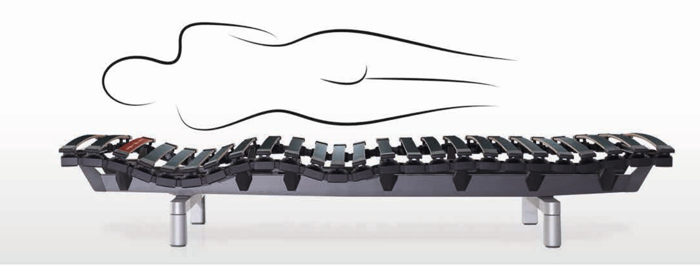
Self-regulating Swissflex bridge® technology integrated