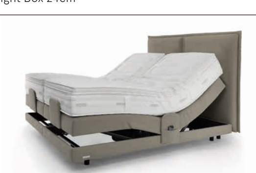
Swissflex® Box _75RF bridge® 2 motors, radio control Back section and upper/lower leg section electronic height 24cm: lower Box 8cm/upper Box 16cm 2-part slat base incl. synchronous cable