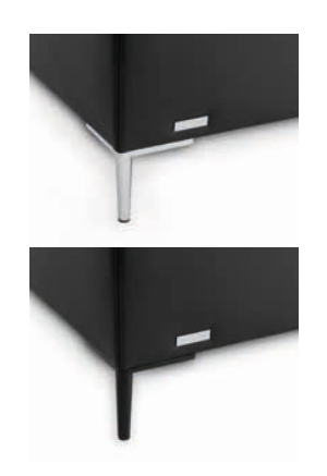
Optional Metal feet Round chrome or black, 10 or 15cm