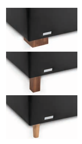
Optional Feet in real wood Square, round (conical) or square. Oak or walnut 5, 10 or 15cm