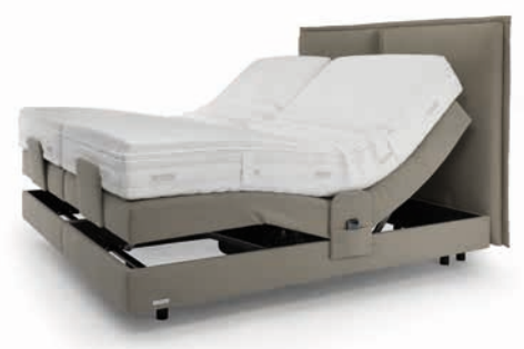
Swissflex® Box _75RF bridge® 2 motors, radio control Back section and upper/lower leg section electronic height 33cm: lower Box 17cm/upper Box 16cm 2-part slat base incl. synchronous cable