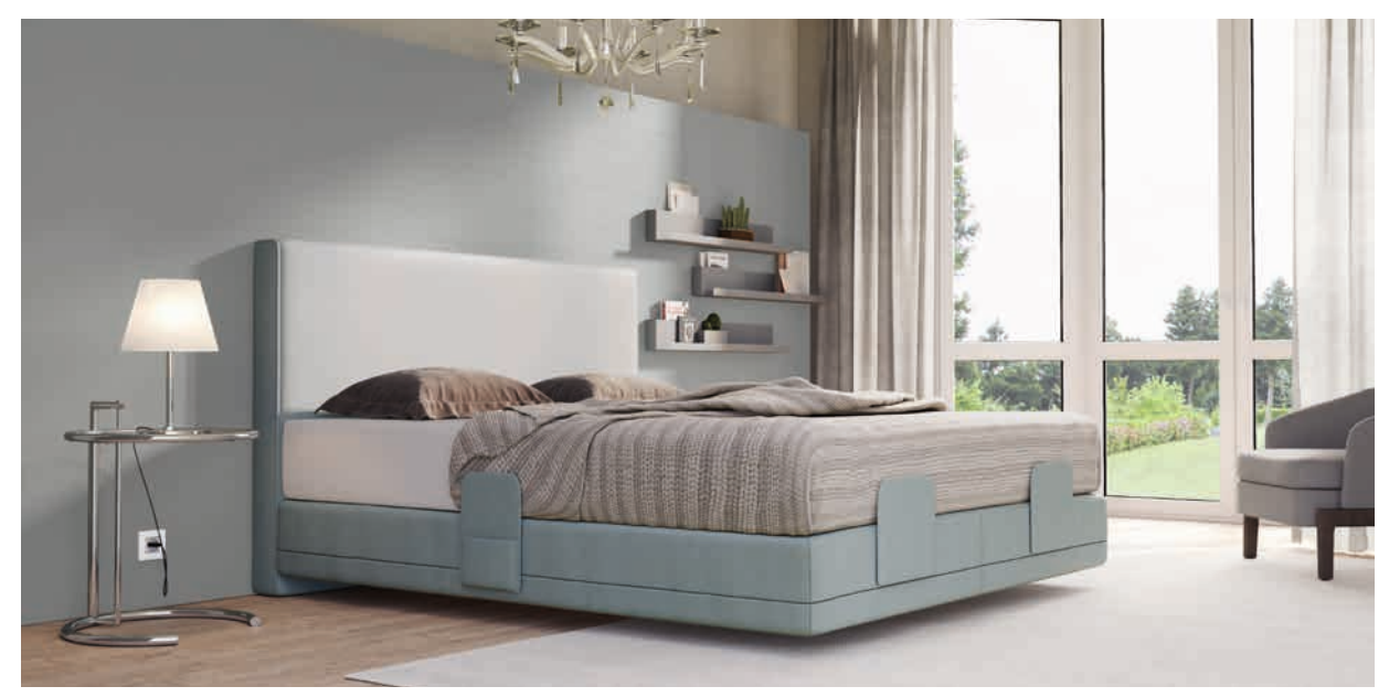
Swissflex ^{\circledcirc} \ Box\_95RF, \ height\ 24cm, \ headboard\ Peking\ 133.5cm, \ fine\ fabric\ upholstery\ Nature\ Aqua