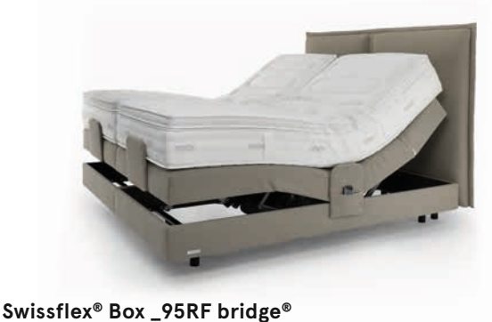
4 motors, radio control (head-, back-, upper and lower leg section individually adjustable) height 33cm: lower Box 17cm/upper Box 16cm 2-part slat base incl. synchronous cable