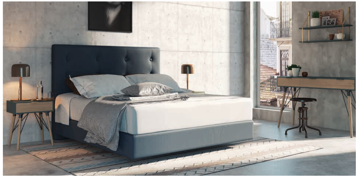
Swissflex® Box_05, height 24cm, with wrap-around removable cover Headboard Madrid 133.5cm, fine fabric padding Secret Midnight