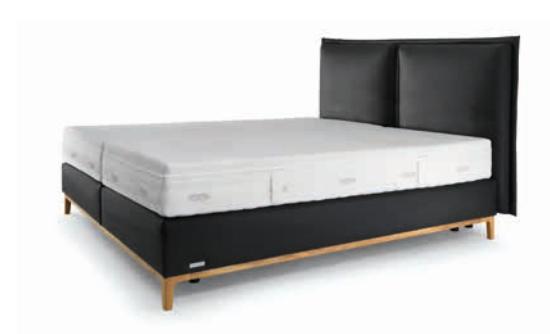
Swissflex® Box _05 bridge® Fix Height Box 24cm