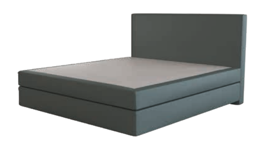
Swissflex® Box _05 bridge® with mattress in Deco fabric Height 24cm, with mattress SF Hybrid 18 Deco (core analogue to Swissflex Hybrid base core) core height 18cm