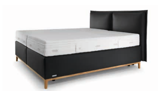
Swissflex® Box _05 bridge® Fix Height Box 33cm